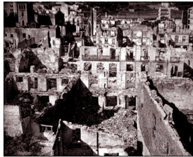
Guernica, Spain after 1937 bombing